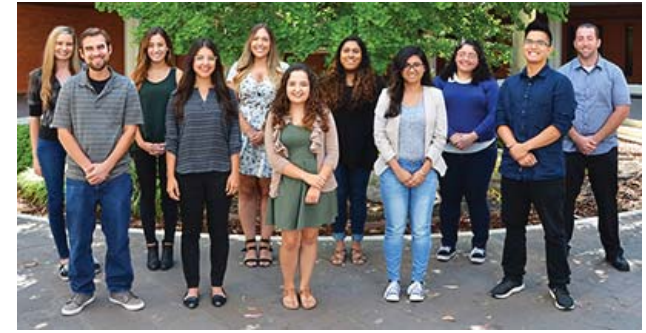
Fall 2017 MAPR Cohort

Communicate both orally and in writing at a level that is appropriate for professionals in their chosen area of specialization.